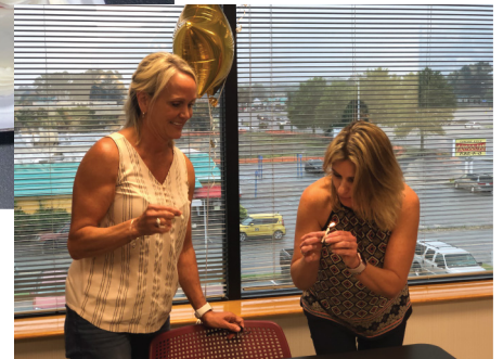
Celebrating June Birthdays