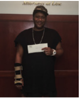
Winner of Washington vs. Dallas Tickets

Be on the lookout for future raffles and additional chances to win. We appreciate you and want to show it!